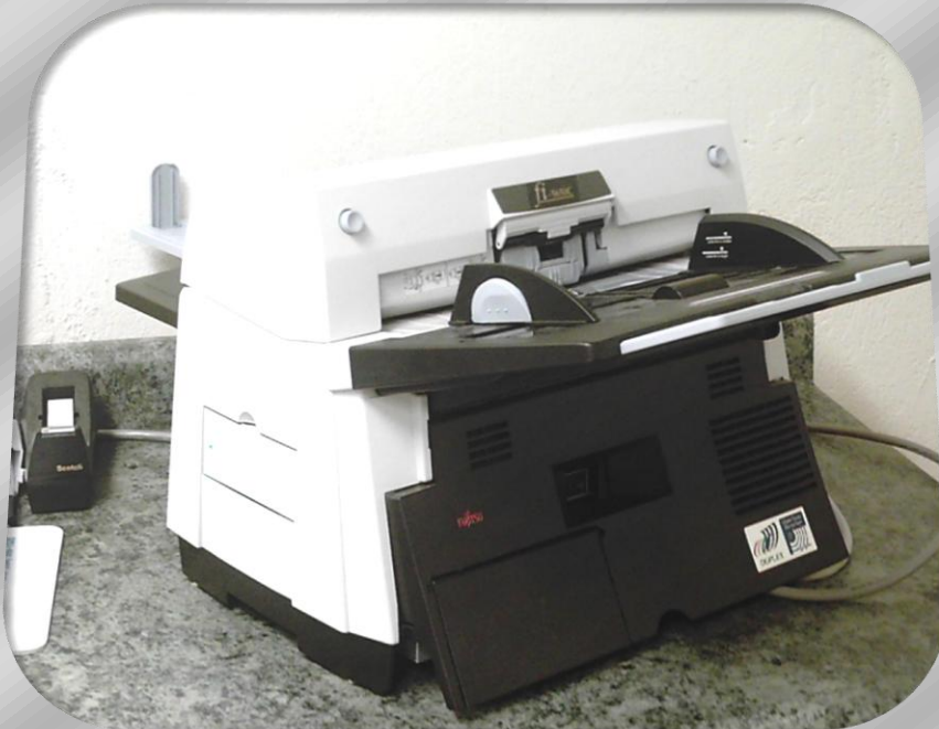
Fujitsu Duplex Document Scanner

8.5" X 14" Legal Size Plat: is scanned into our records management system for storage and public viewing