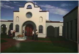
The architect's rendition of the new chapel.