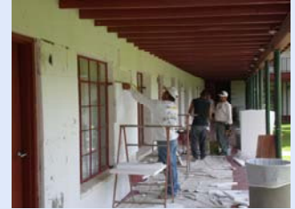
In the picture above the workers are placing the foam insulation on the wall. The picture below, the workers are putting the final color coat of stucco on the wall.

You may not have the means of providing the finances to pay for such big of a project as stuccoing one of the hotel units; however, there are small projects that are needing our attention. Some of these smaller projects are: replacing the outdoor chairs, replacing the chairs in the large conference room, getting the chairs in the small conference room reupholstered, and painting the dining room. These are but a few of the on-going projects at the Re-