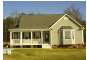
Parade of Home entry: The Liberty. Location: Tralee Golf & Athletic Club Square Footage: 1378 + 702 unfinished Sales Price: $139,500

Jarman Homes is pleased to announce our 2004 Parade Entry is our "Liberty" Plan in Tralee Golf & Athletic Club. (See us on page 82 in the Parade Book.) The plan has been a good seller in Tralee featuring a beautiful front elevation with a wrap-around porch and bay window. The interior is a must see with the latest trends in lighting, countertops, and flooring. Complemented with beautiful warm tones in color and texture found throughout. But the Liberty's most popular selling feature is definitely the 702s.f