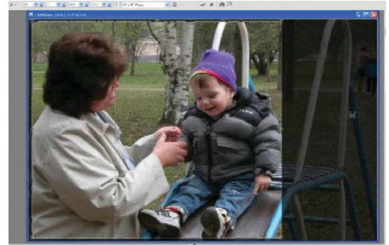
Cropping a photo is simple. Just select the crop tool, and drag a box around the area you want to keep.

To crop a photo using PhotoImpact you will need to start up PhotoImpact and open the photo you want to work with. Next, you will select your cropping tool. Click on your starting point in the upper left corner of the photo and drag it down and across your photo. You will see a grid that shows the area of the photo that you want to keep. The area that is darkened will be the area of the photo that will be discarded. You can click on the corners and drag the box to make adjustments to crop tighter or more open. When you have the desired cropping area selected just double click on it and this will complete cropping the photo. You will now see what your new photo will look like.