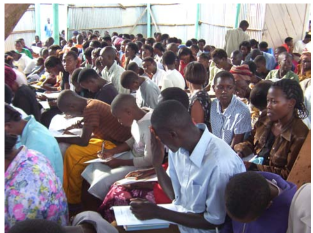
People Filling Out the Repentance Worksheets