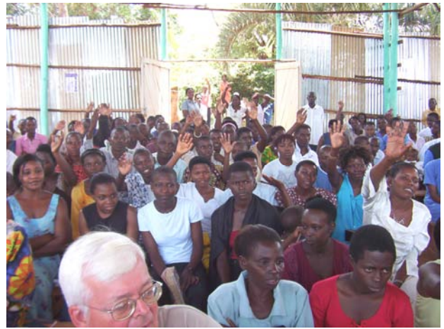
Raised Hands of Those Who Have No Bibles in Kampala, Uganda