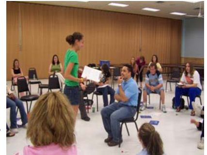
Youth Mapping training provided important work readiness skills like public interaction and teamwork

The information collected by the “Mappers” includes types of services and opportunities, ages served, eligibility criteria, languages spoken, accessibility of facilities, transportation and more. Cont’d on pg 5