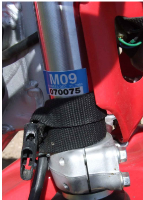
Placement of the IDPR OHV registration sticker for off-highway use:

The IDPR OHV registration sticker requirement doesn't apply to vehicles that are only used for agricultural or snow plowing purposes. If you use your motorbike, ATV or UTV for hunting or recreational purposes, it must have a valid IDPR OHV registration sticker.