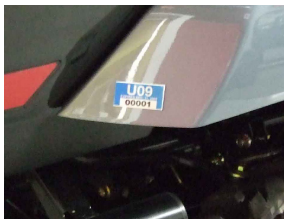
ATV and UTV upon the rear fender.