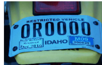
Sticker must be affixed to the restricted vehicle license plate.