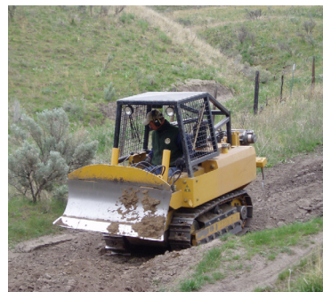
Your registration dollars at work : Trail Ranger / Cat program building and maintaining trail